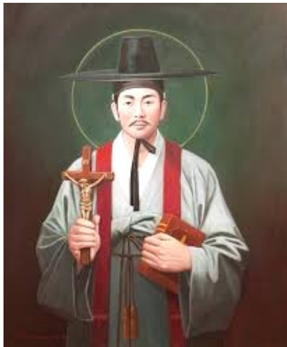
SAINT ANDREW KIM TAE-GON