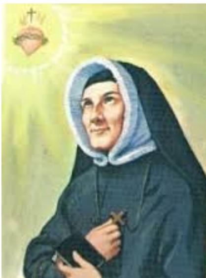
ST. MADELEINE SOPHIE BARAT